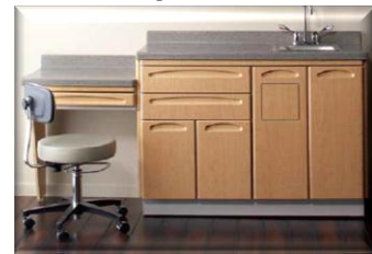
Seamless Finger Pulls

The Superior Impact Resistance means that your cabinets can be exposed to higher abuse before it must be considered for replacement. The amount of impact that would chip, crack and expose the substrate of a High Pressure Laminate would simply cause a dent in a Dackor 3D Laminate.